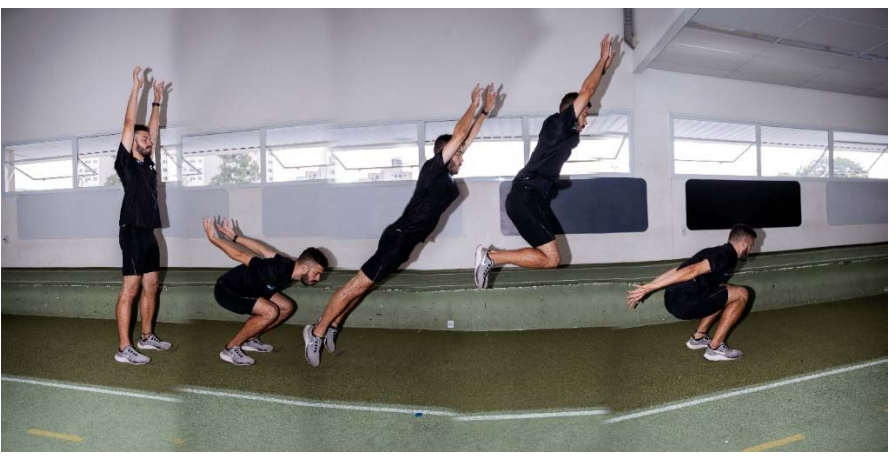
Figure 6. Standing long jump sequencing.