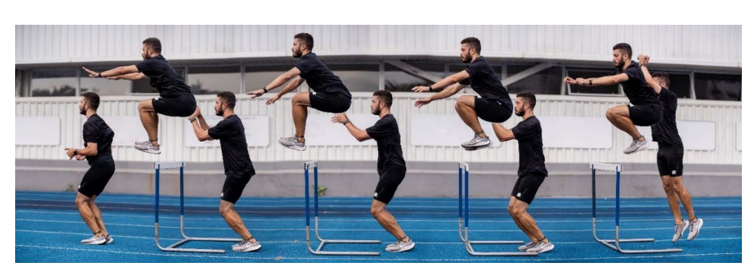
Figure 1. Hurdle jumps sequencing.