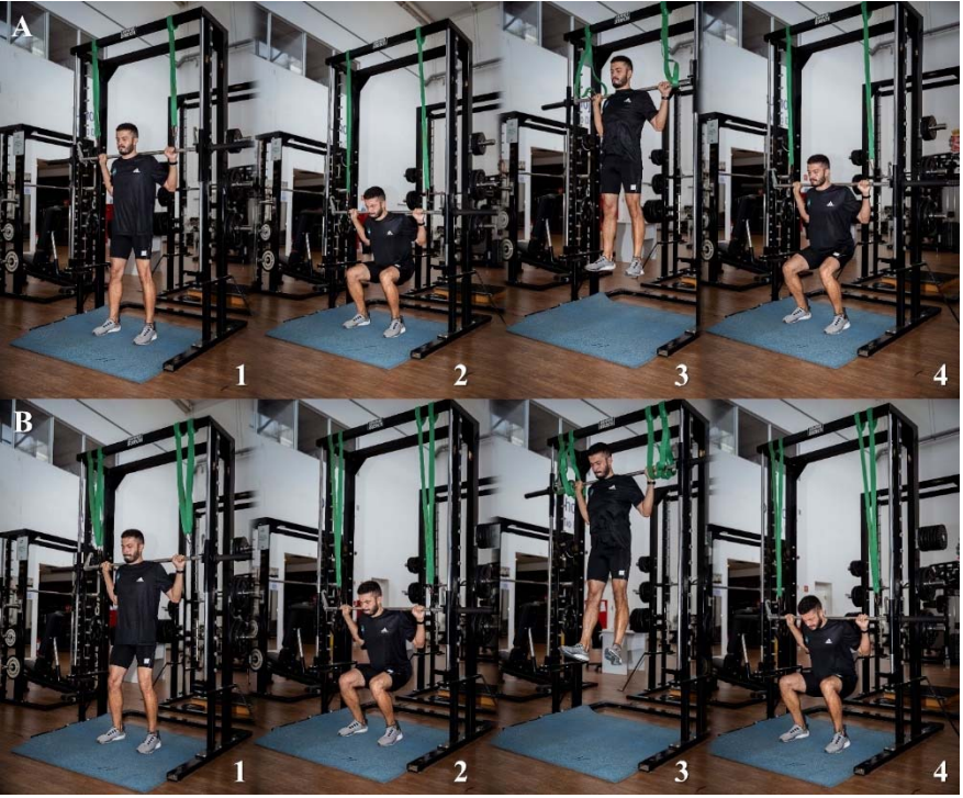
Figure 4. Assisted jumps execution, under two different conditions: "using the adequate elastic resistance" (Panel A) and "using an excessive elastic resistance" (Panel B), at the starting standing position (1), initial portion of the concentric action (2), and at the flight (3) and landing (4) phases.