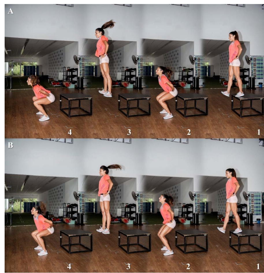
Figure 2. Drop jumps execution, under two distinct verbal instructions: "jumping for maximum height" (Panel A) and "jumping for maximum height with minimum contact time" (Panel B), at the initial (1), contact (2), flight (3), and landing (4) phases.