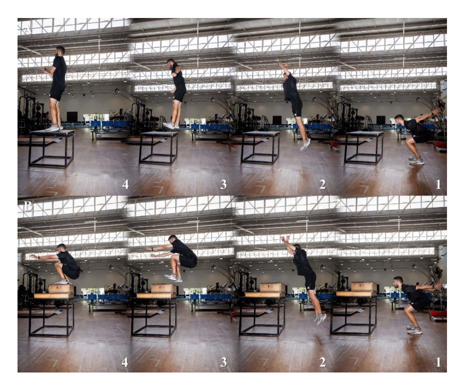
Figure 3. Box jumps execution, under two different conditions: "using the optimal box height" (Panel A) and "using an exaggerated box height" (Panel B), at the initial (1), flight (2), final approaching (3), and landing (4) phases.